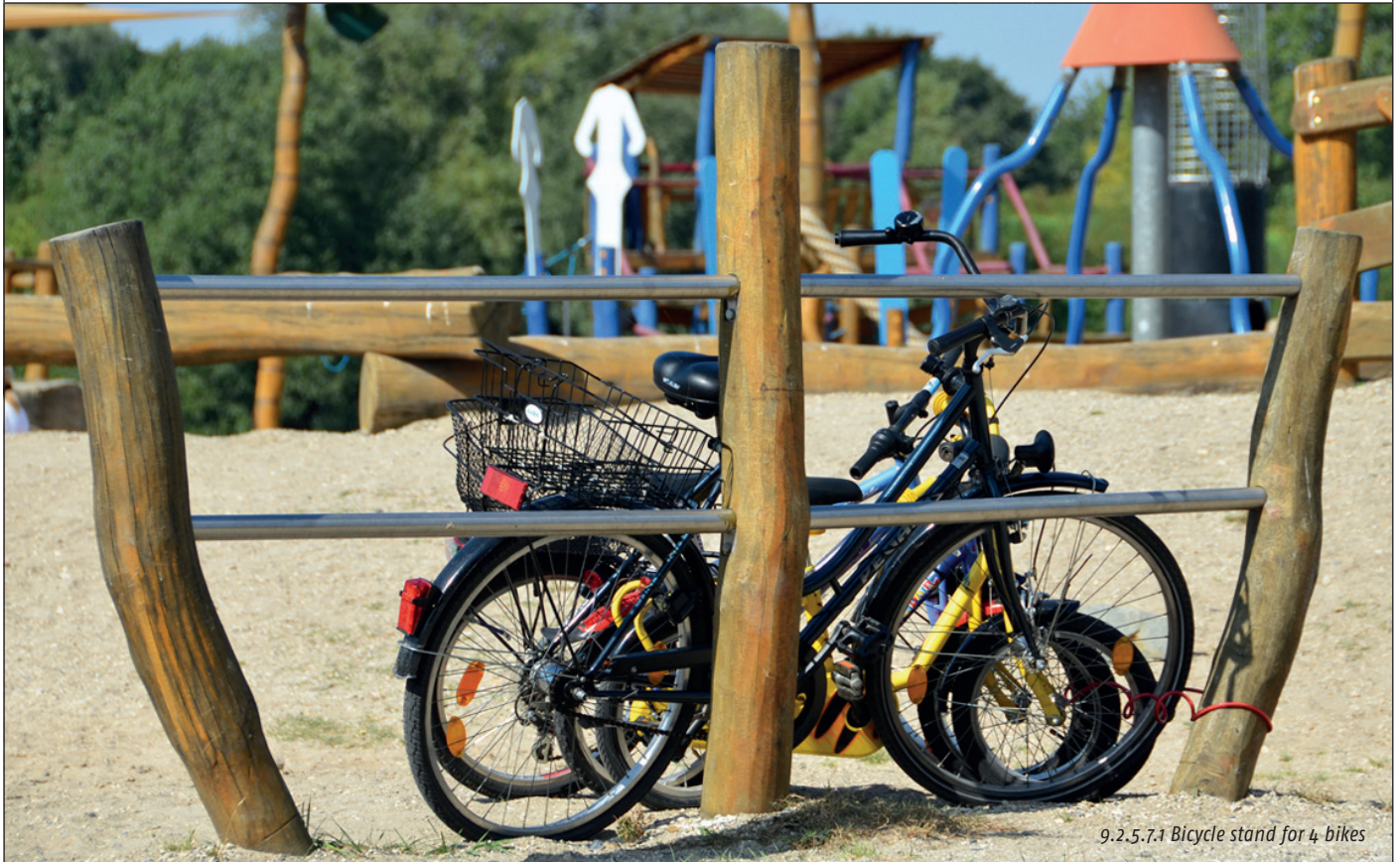
9.2.5.7.1 Bicycle stand for 4 bikes