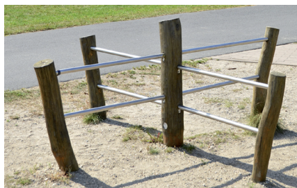
9.2.5.7.2 Bicycle stand for 8 bikes

Lenght (total): 3.0 m Height (rods, stainless steel): 0.5 m / 0.9 m Colour: robinia bright