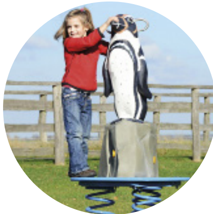
1.51.1 «Penguin Pedro»