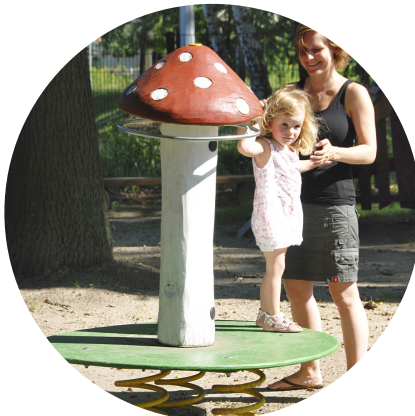
1.54.1 «Fly Agaric»