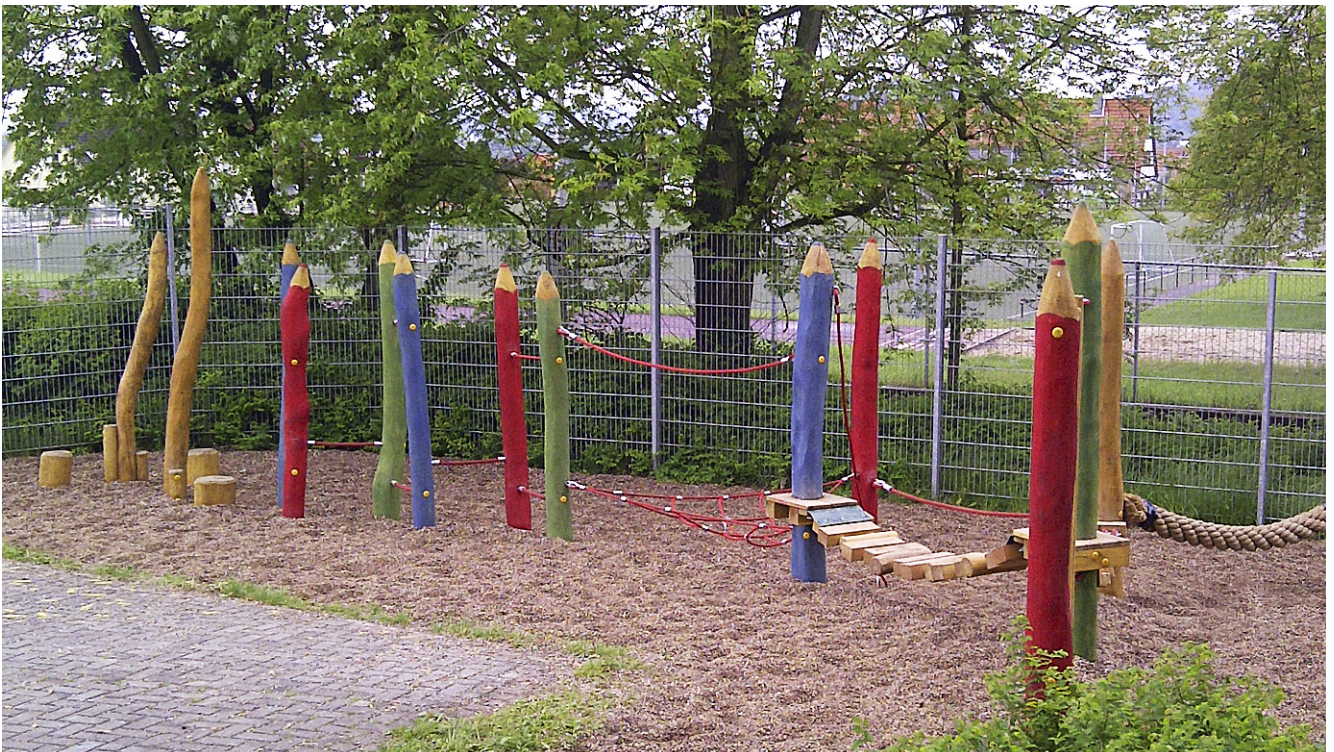
alternative: 2.15.12.15 Balancing course «Coloured pencil»