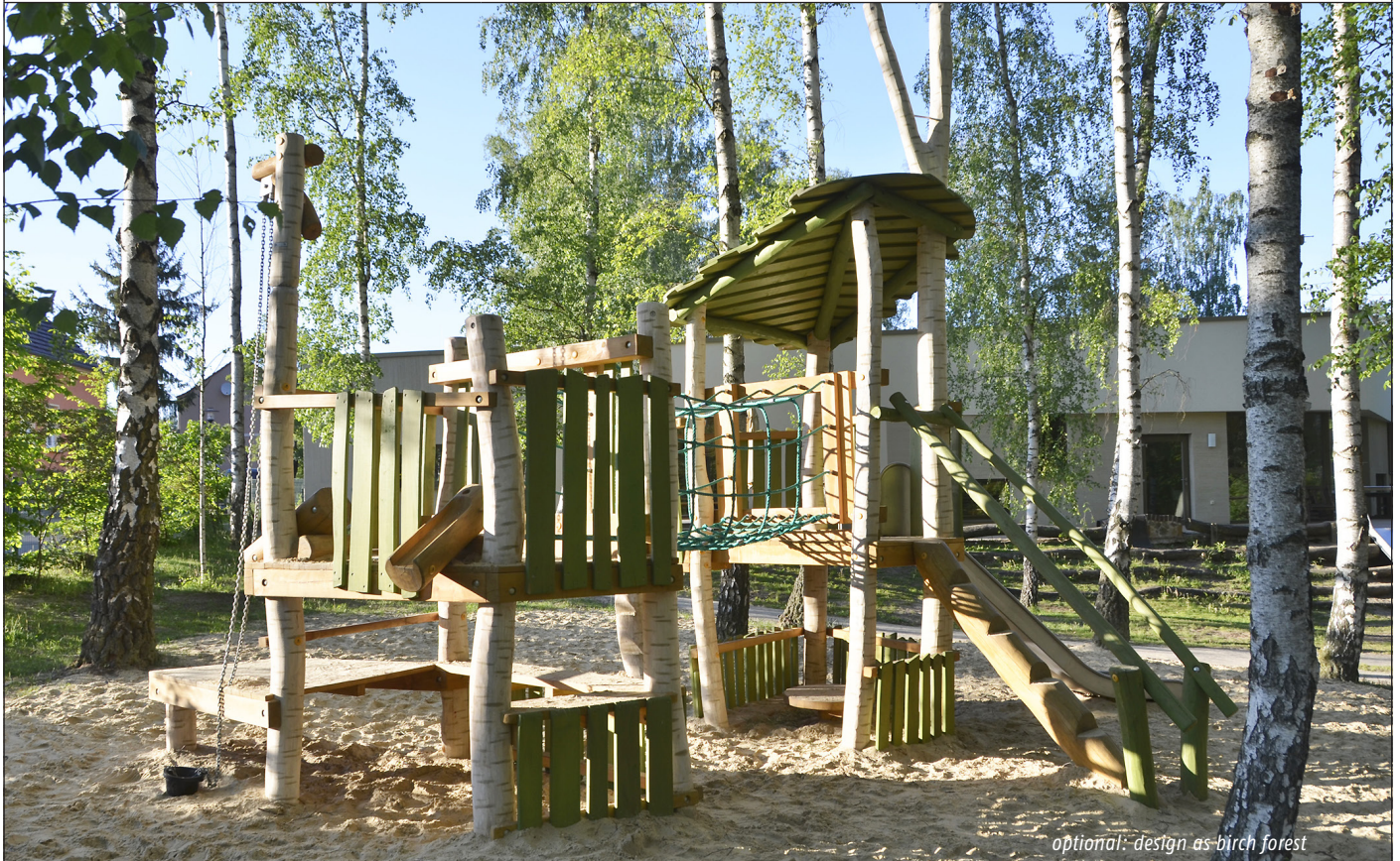
optional: design as birch forest