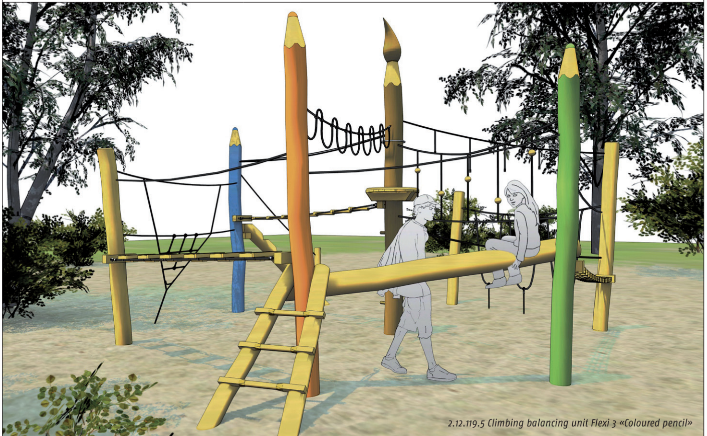
2.12.119.5 Climbing balancing unit Flexi 3 «Coloured pencil»