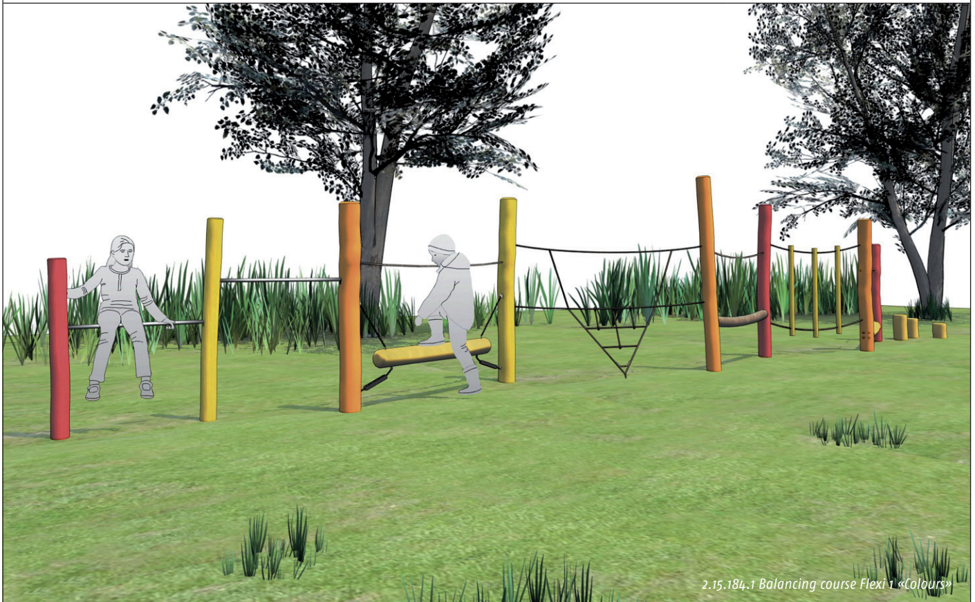
2.15.184.1 Balancing course Flexi 1 «Colours»